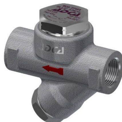
( Threaded nickel plated )

OPTIONS: Insulation cover Blowdown valve USE: Saturated and superheated steam. AVAILABLE MODELS: DT 42/2 SIZES: DN ½" to DN 1" – DN15 to DN25 CONNECTIONS: Female screwed ISO7/1 Rp (BS21) Flanged EN1092-1 PN40-PN63 or ANSI INSTALLATION: Horizontal installation recommended. Can be installed in any position. APPLICATION LIMITS: Min-working pressure – 0,25 bar Max.working back pressure – 80%