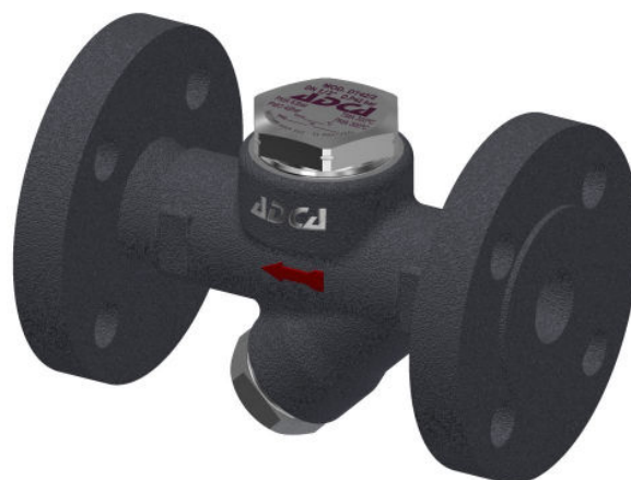
( Flanged and SW black painted )